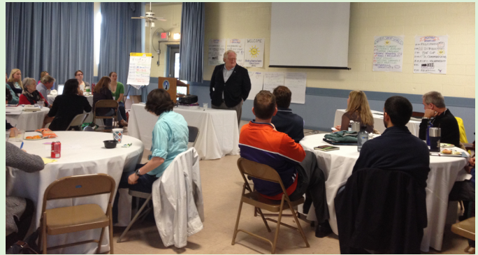
City of Beaufort, SC Mayor Billy Keyserling gives the keynote to wrap up the 2016 meeting.

The meeting will be held at the Hilton Garden Inn Charleston Waterfront/Downtown. All room reservations must be made by April 10 to secure the discounted rate. Registration will close April 17, 2017.