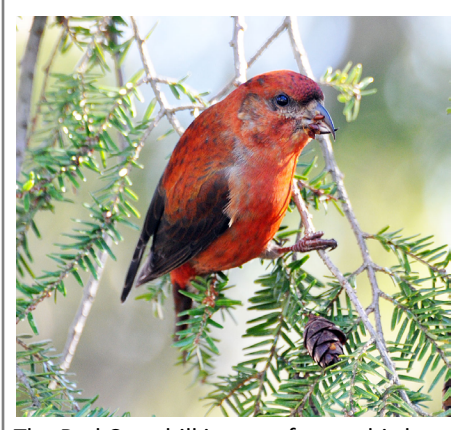
The Red Crossbill is one of many bird species recorded by citizen science activities that advance conservation strategies at places like Grandfather Mountain State Park in North Carolina which is an anchor of the Grandfather Mountain Important Bird Area.

Citizen Science has significantly contributed to the current resilience planning of North Carolina Audubon. Contributions range from data to advocacy and result in stronger programs for avian survival in the face of climate change.