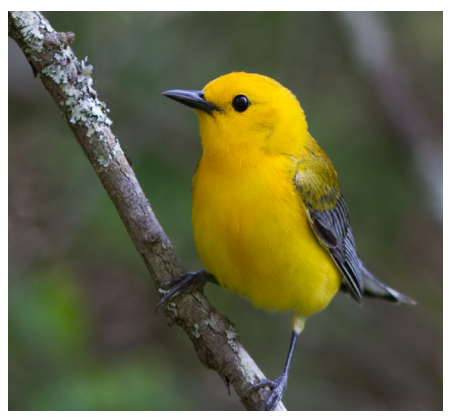
The Prothonotary warbler is Audubon's 2017 Bird of the Year! Their population has decline by 42 percent since 1966. Protecting stream buffers, building nest boxes, prioritizing conservation of their habitat and surveying populations will help this warbler to survive.