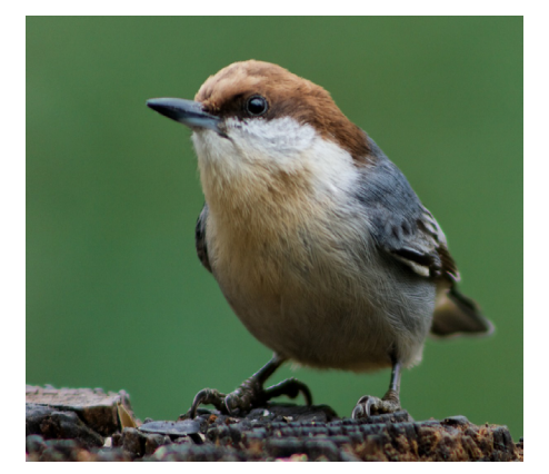
The Brown Headed nuthatch is currently the focus of several Audubon conservation efforts including the Climate Watch Program and nuthatch nest boxes.